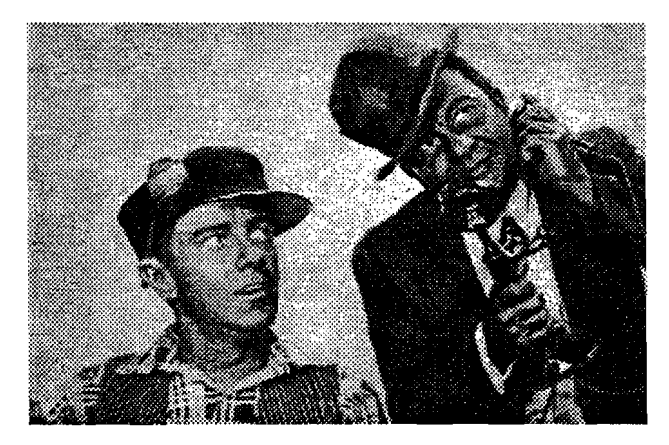
UNHOLY MATRIMONY: Radio's most reluctant newlywed, Andy's been neck-deep in woe since he said "I do" to Abigail